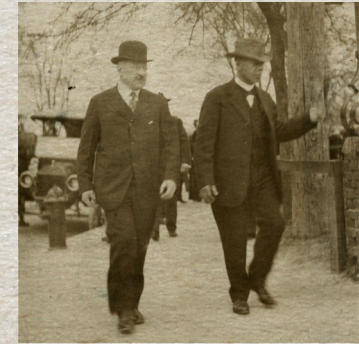
Julius Rosenwald and Booker T. Washington, Tuskegee Institute 1915.

Not only did Julius Rosenwald provide seed funding for 5,300 schools in 16 rural Southern states, he also awarded fellowship grants to African-American intellectuals and artists, including such notables as: Opera Singer: Marian Anderson; Diplomat: Ralph Bunche; Civil Rights Activists: W.E. B. Dubois, and Julian Bond's father (Horace Mann Bond); Dancer: Katherine Dunham; Authors: Ralph Ellison, Langston Hughes, Zora Neale Hurston, James Baldwin; Photographer: Gordon Parks; Painter: Jacob Lawrence; and Sculptor: Augusta Savage.