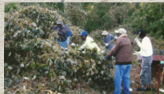
Alumni dig out their school by hand