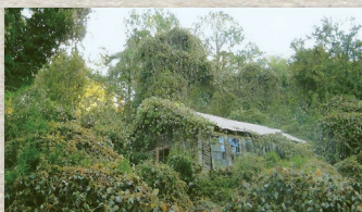
The first grade school building, the only remaining building